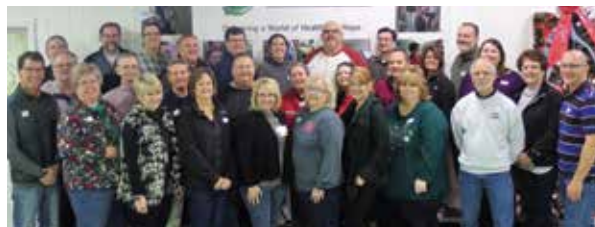
Hardin Memorial Hospital