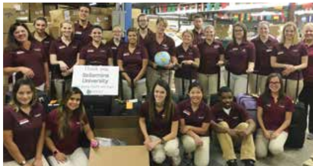
Bellarmine University Nurses