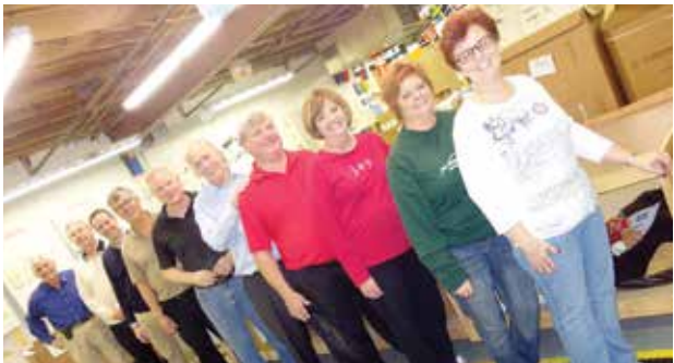
Louisville Downtown Rotary