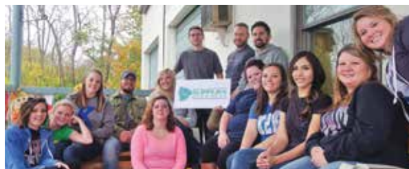
Owensboro Community & Technical College