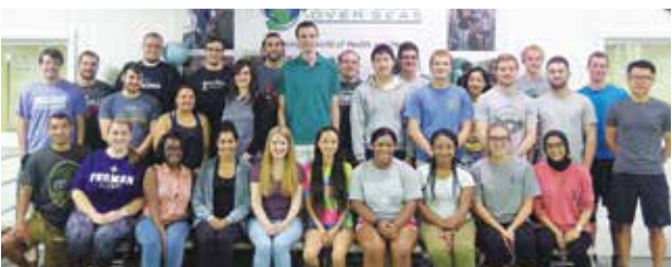
U of L Medical Students