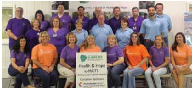
KentuckyOne Health Group

It takes thousands of volunteer hours to transform the surplus medical supplies and equipment that SOS recovers into the materials that deliver health and hope to communities in need. Put simply, volunteers are the lifeblood of SOS . SOS relies on volunteer hands in order to accomplish a myriad of essential functions, including: administrative support; biomedical expertise; inventory management; volunteer management; fundraising support; and, of course, sorting supplies! Pictured are just a few of the beautiful people who make SOS work.