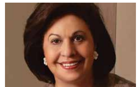
HRH Crown Princess Katherine

Afterwards, she also recorded a video to thank SOS and its donors personally. The video was shown at our first Health & Hope Breakfast in October (see p. 8).