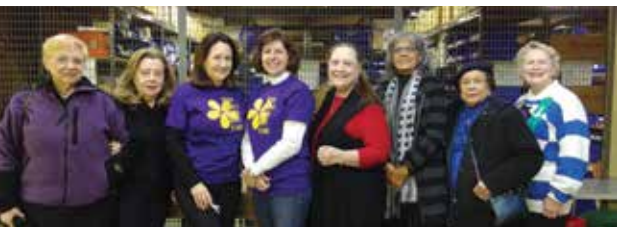
Greater Louisville Medical Society Auxillary